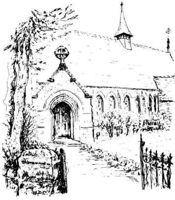
ST AGNES, WEST KIRBY