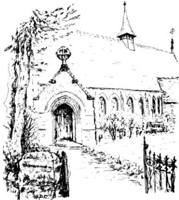
ST AGNES, WEST KIRBY